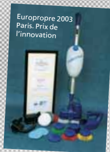
Europropre 2003 Paris, Prix de l'innovation

Setting standards in mechanized manual cleaning and polishing