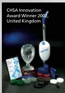
CHSA Innovation Award Winner 2002, United Kingdom